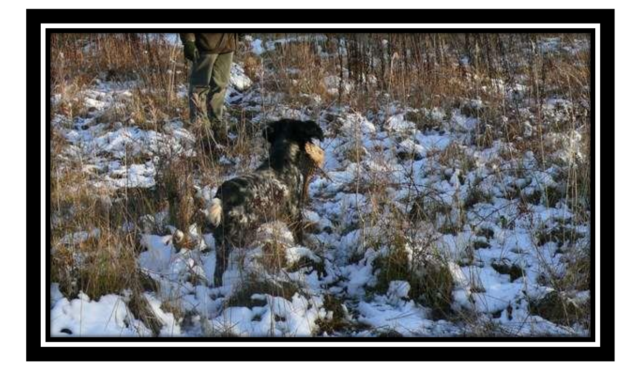
SOME PHOTOS OF THE SHOOTING AREA AND HOTEL