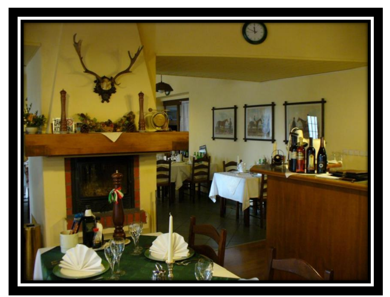
Restaurant's dining room