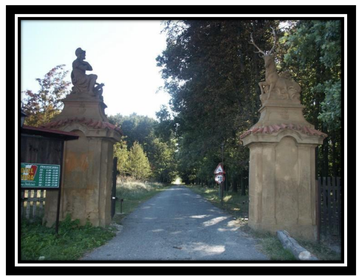
Main entrance of the hotel