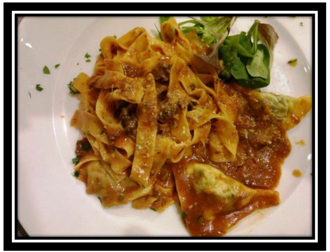
Fettuccine with game – mushroom ragú