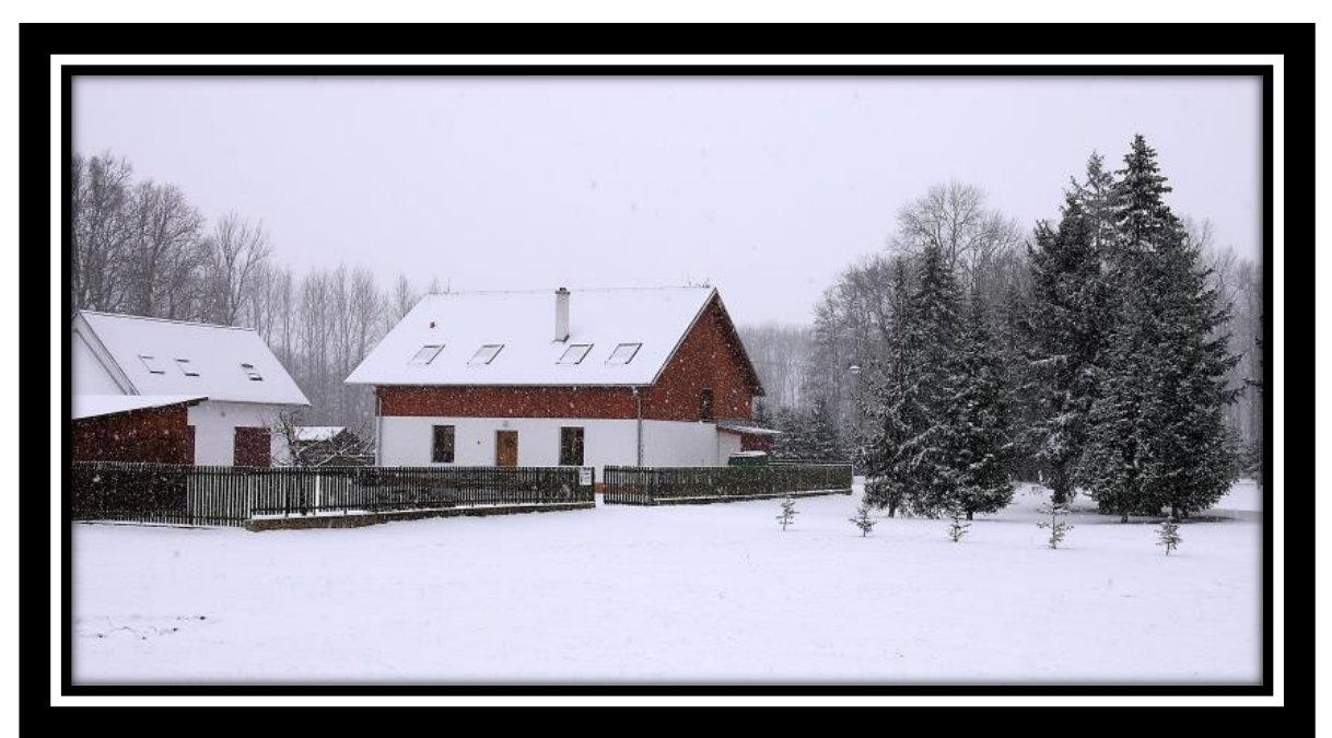
Area of the phesants shooting with lodge