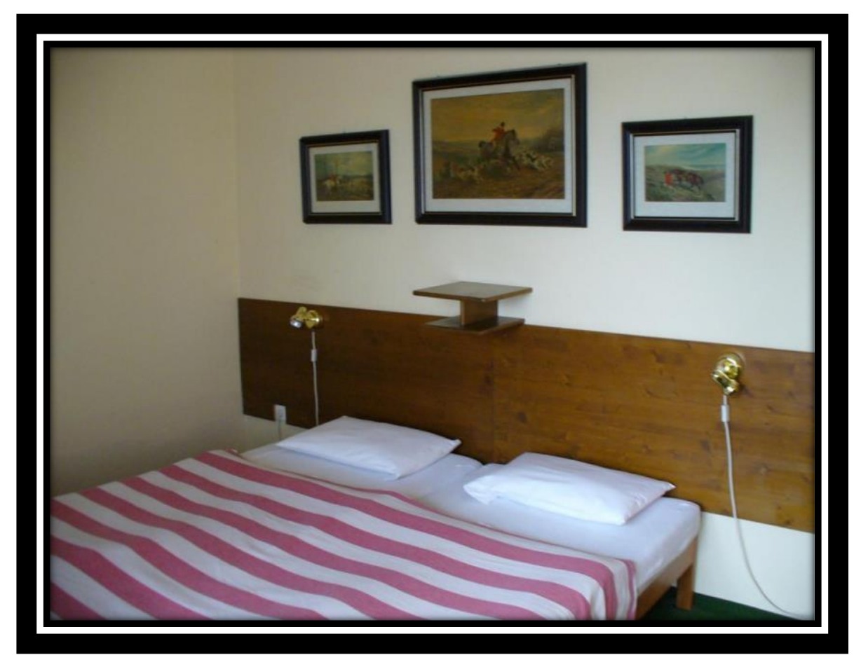
A room of the hotel